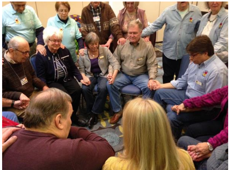
Commissioning of new leadership couples

On the following page is the reimbursement form for requesting funds from the North American Region funds.